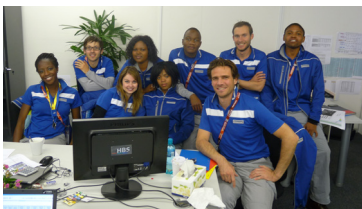
The HBS Invoicing & Receivables team - here to help

MRLs are reminded about a few issues related to the payment of services: